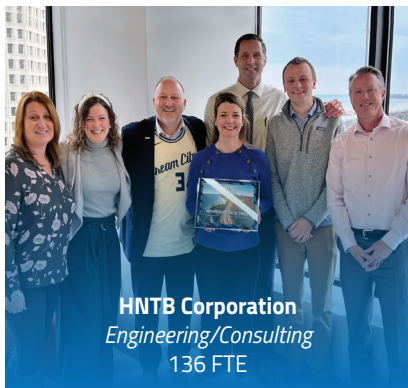
HNTB Corporation Engineering/Consulting 136 FTE

“We are members because we want to understand the direction the state is going... the information provided by MMAC has been very important to us.”