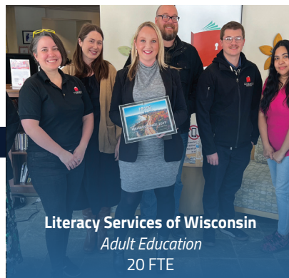
Literacy Services of Wisconsin Adult Education 20 FTE

“It is imperative to be engaged with the business community, to leverage policies and make the region attractive for businesses and employees.”